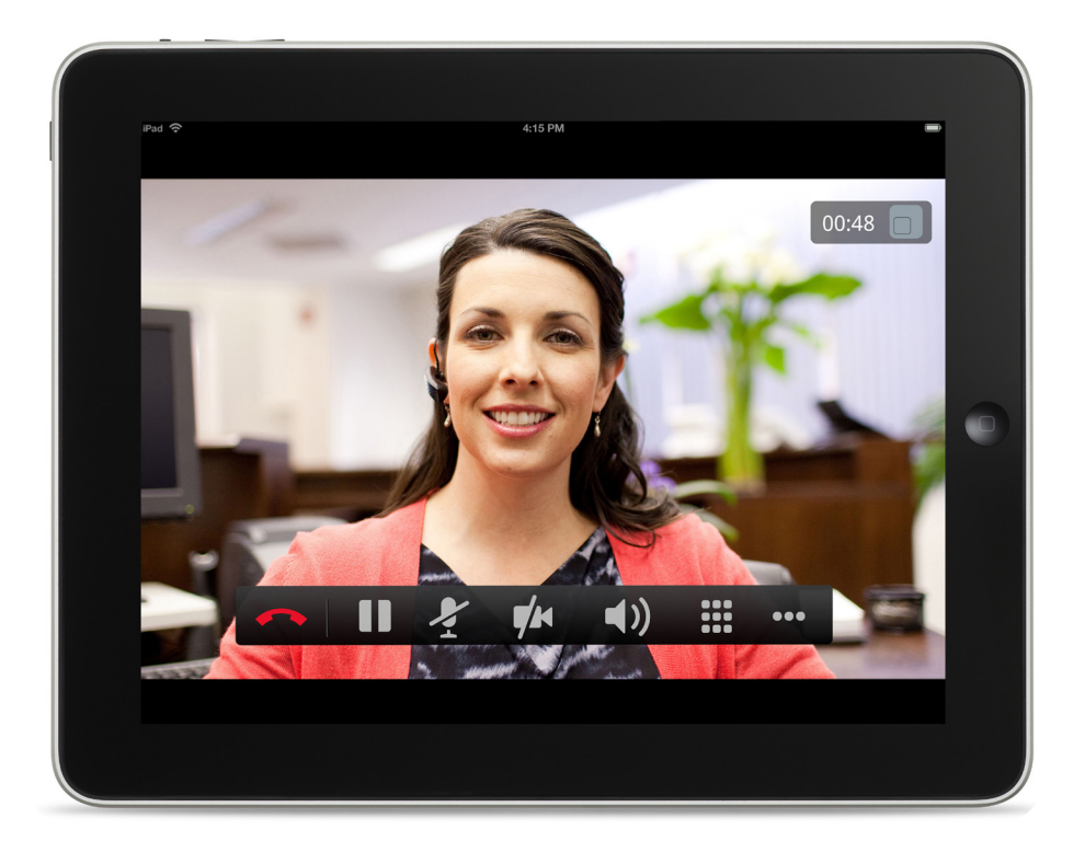
Figure 1 – Mobile Workers Can Join TelePresence Sessions from Anywhere with Personal Tablets

Employees can transform any personal or government-owned device with a camera into a telepresence endpoint by using Cisco Jabber Video for TelePresence software (Figure 1). Or, without any special software, they can use the Cisco WebEx cloud service to meet with video, audio, and desktop sharing. WebEx meeting participants can see each other in high-definition video, and can opt to see the active speaker in full-screen theater mode.